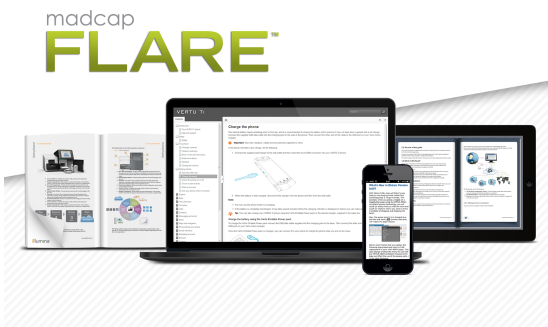
Figure 4-3 Figure caption.

Here is some general text for a topic. Replace this with your own content. Here is some general text for a topic. Replace this with your own content. Here is some general text for a topic. Replace this with your own content. Here is some general text for a topic. Replace this with your own content. Here is some general text for a topic. Replace this with your own content. Here is some general text for a topic. Replace this with your own content. Here is some general text for a topic. Replace this with your own content.