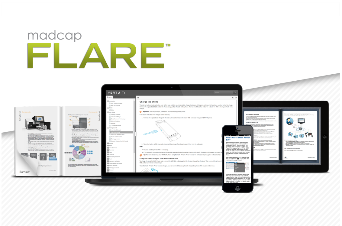
Figure 1-1 Figure caption

Here is some general text for a topic. Replace this with your own content. Here is some general text for a topic. Replace this with your own content. Here is some general text for a topic. Replace this with your own content. Here is some general text for a topic. Replace this with your own content. Here is some general text for a topic. Replace this with your own content. Here is some general text for a topic. Replace this with your own content. Here is some general text for a topic. Replace this with your own content. Here is some general text for a topic. Replace this with your own content.