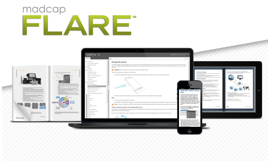
Figure 1-3 Figure caption.

Here is some general text for a topic. Replace this with your own content. Here is some general text for a topic. Replace this with your own content. Here is some general text for a topic. Replace this with your own content. Here is some general text for a topic. Replace this with your own content. Here is some general text for a topic. Replace this with your own content. Here is some general text for a topic. Replace this with your own content. Here is some general text for a topic. Replace this with your own content. Here is some general text for a topic. Replace this with your own content.