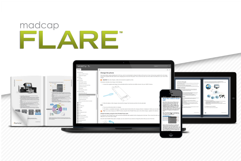
Figure 1-4 Figure caption.